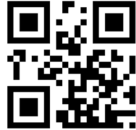
Figure 2. Example of Next Generation Bar Code

New labeling schemes (the next generation of bar codes) have recently been developed that have the potential to revolutionize how consumers can access information about products (Figure 2). Working with Agency Magma 11 , a company whose mission is to create new and innovative ways for people to interact with information, entertainment, and media, a “nano” consumer product data tag was developed that demonstrates how advances in technology can enable the public to gain access to more product information.