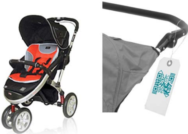
Figure 3. Example of QR-Code for Nano Enabled Product.

QR-codes, which can be scanned via any web-enabled camera phone, store information such as basic text, web links, text messages, contact information, etc., all inside of its graphical image. QR-codes have already been used in other countries and are beginning to appear in San Francisco and New York City. Unlike traditional bar codes, QR-codes can be designed for any product, creating a unique label that is recognizable and distinct from other tags. These new ID tags could potentially be linked to all of the information that the CPSC has struggled to disseminate amongst the public (product recalls, safety incidences, etc.) Figure 3 is one example of how the tags could work in relation to nanoproducts.